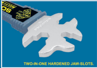
TWO-IN-ONE HARDENED JAW-SLOTS.

INT. DESIGNS REGD. US PAT. # US D448, 981 S