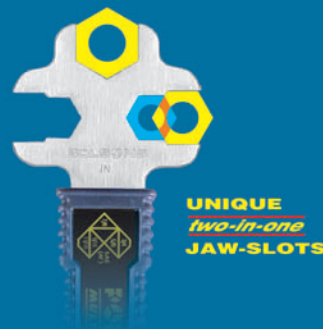
UNIQUE two-in-one JAW-SLOTS