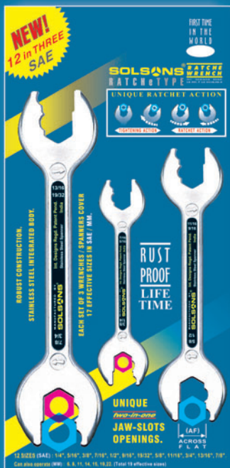
Set of 3 tools packed together on single card