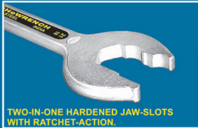
TWO-IN-ONE HARDENED JAW-SLOTS WITH RATCHET-ACTION.

INT. DESIGNS REGD. US PAT. # US D448,981 S